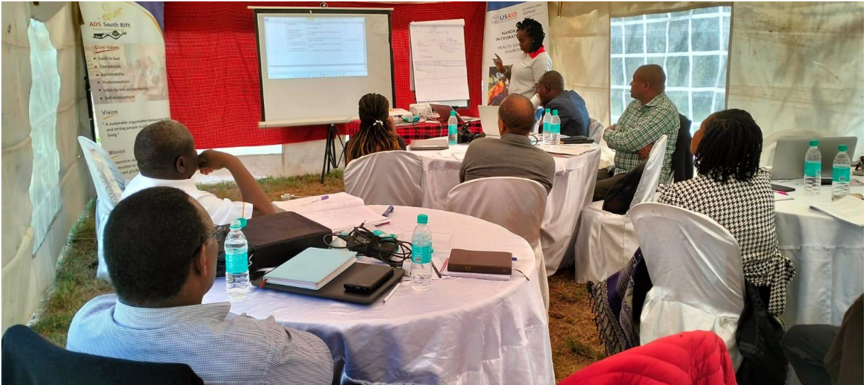
Team of staff engaging in developing the ADS South Rift Strategic plan 2023-2027.

Recognising the importance MEL plan, during the strategic planning process, framework was developed and is illustrated in this chapter. This MEL will guide in measuring all the pillars of ADSS Rift Strategic plan 2023 to 2027. The framework must be read together with the strategic plan 2023 to 2027.