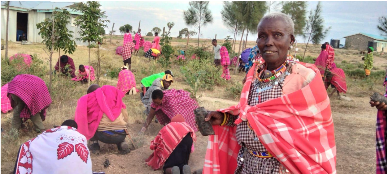
Integrating environment in health programming with Traditional Birth Attendants (Now Mother Companions).