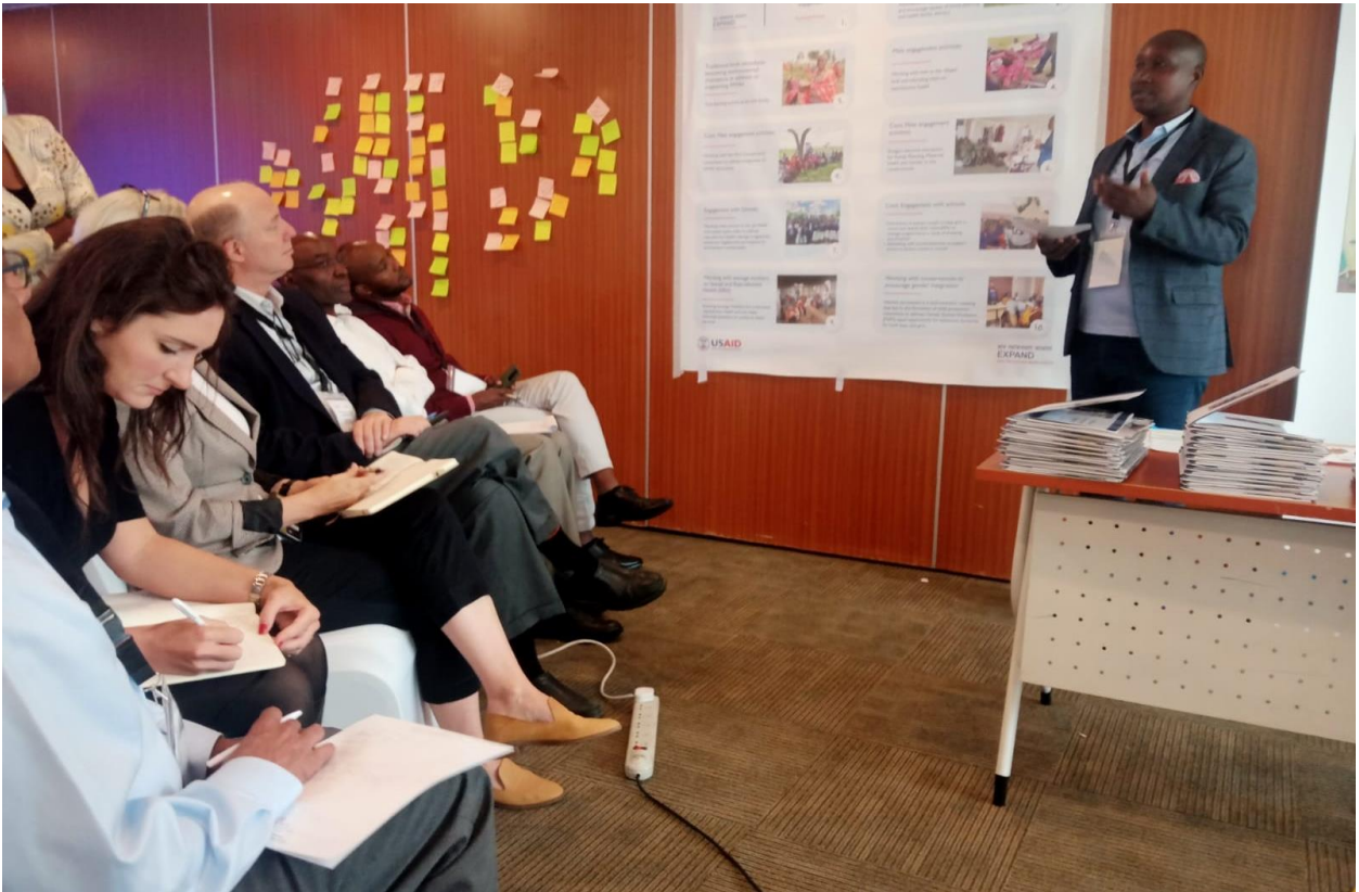
Cross Learning session with USAID NPI partners t in Kenya.