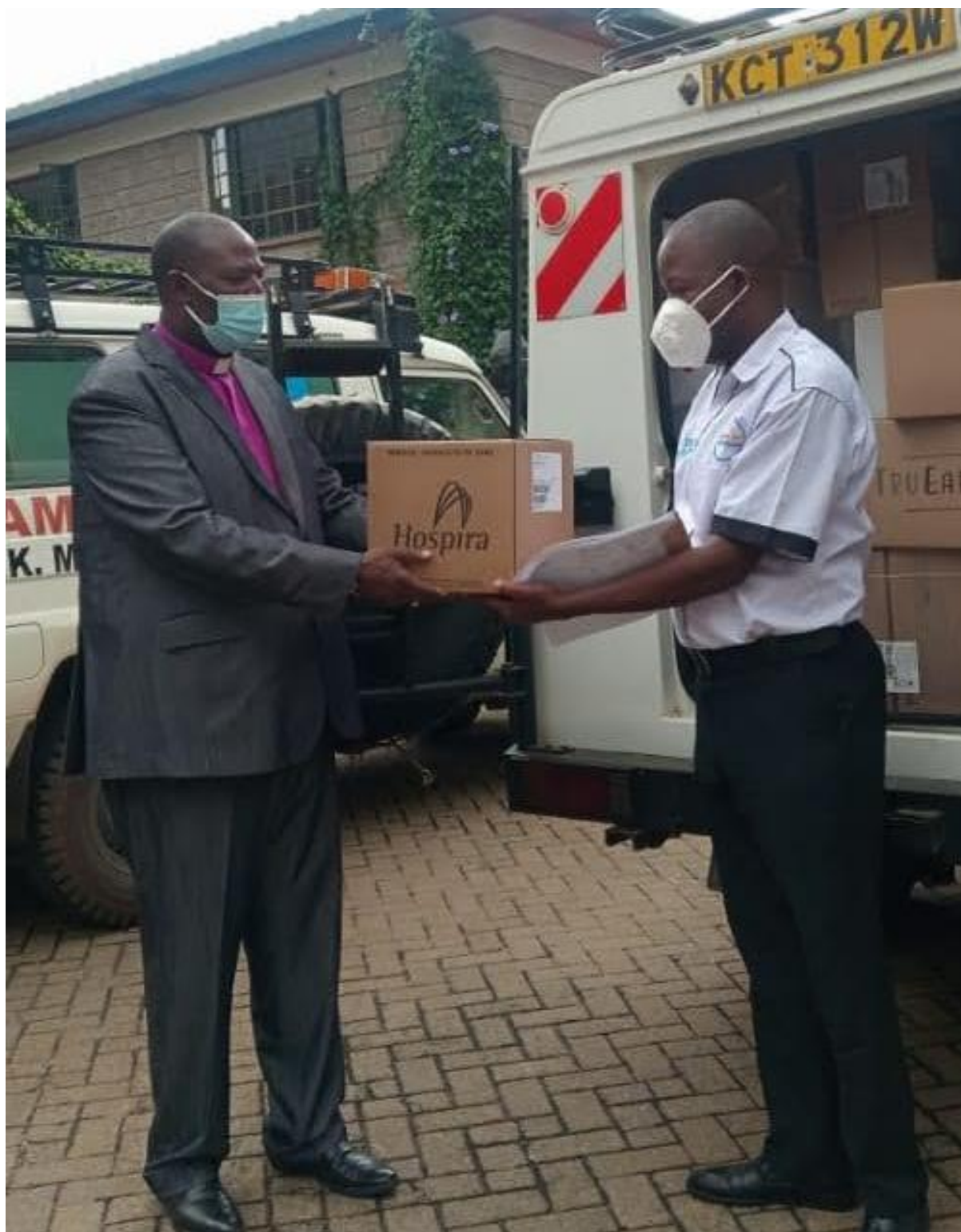
Support for health facilities under ADS SR through ADS Kenya.