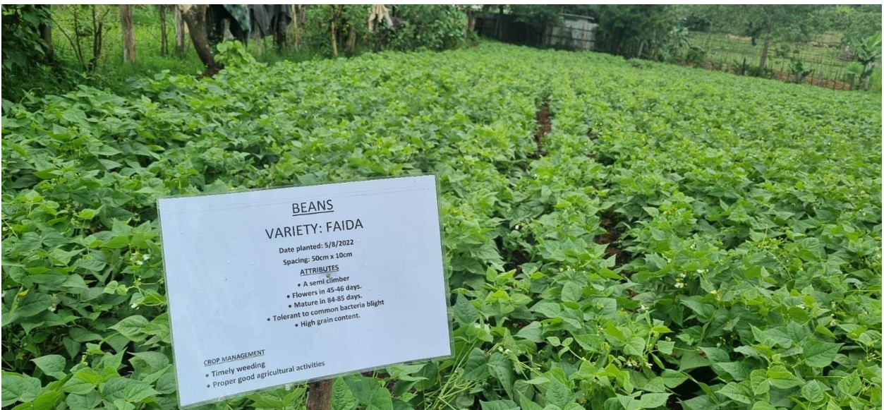
Promoting adoption and commercialization of new bean varieties in Bomet county through KALRO Agri-Fi CS APP project.