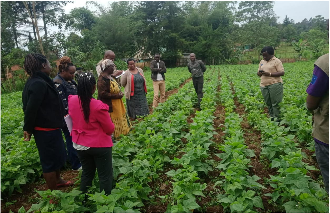
Promoting production and commercialization of new bean varieties- Boito demo plot.