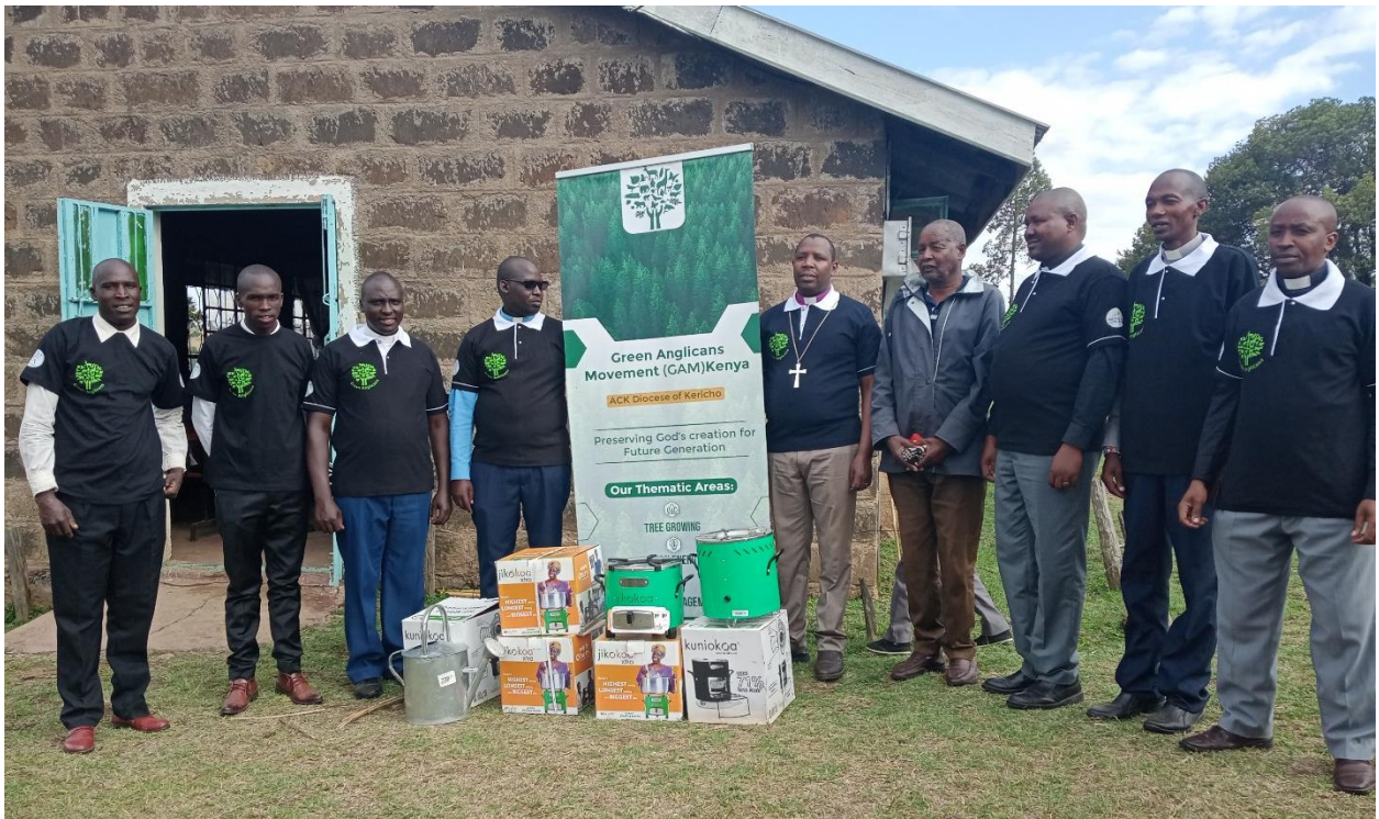
Launching the Green Anglican Movement Diocese of Kericho in Oct 2022 at Olkeri Pari