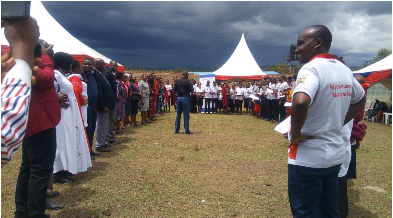
Graduating Community Based Distributers for Family Planning to increase uptake of FP services through NPI Expand Project.