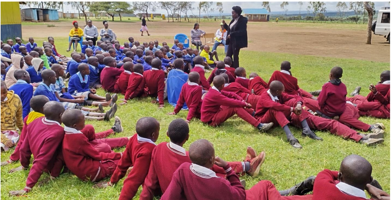
Health and conservation integration session at Nturumeti Primary school