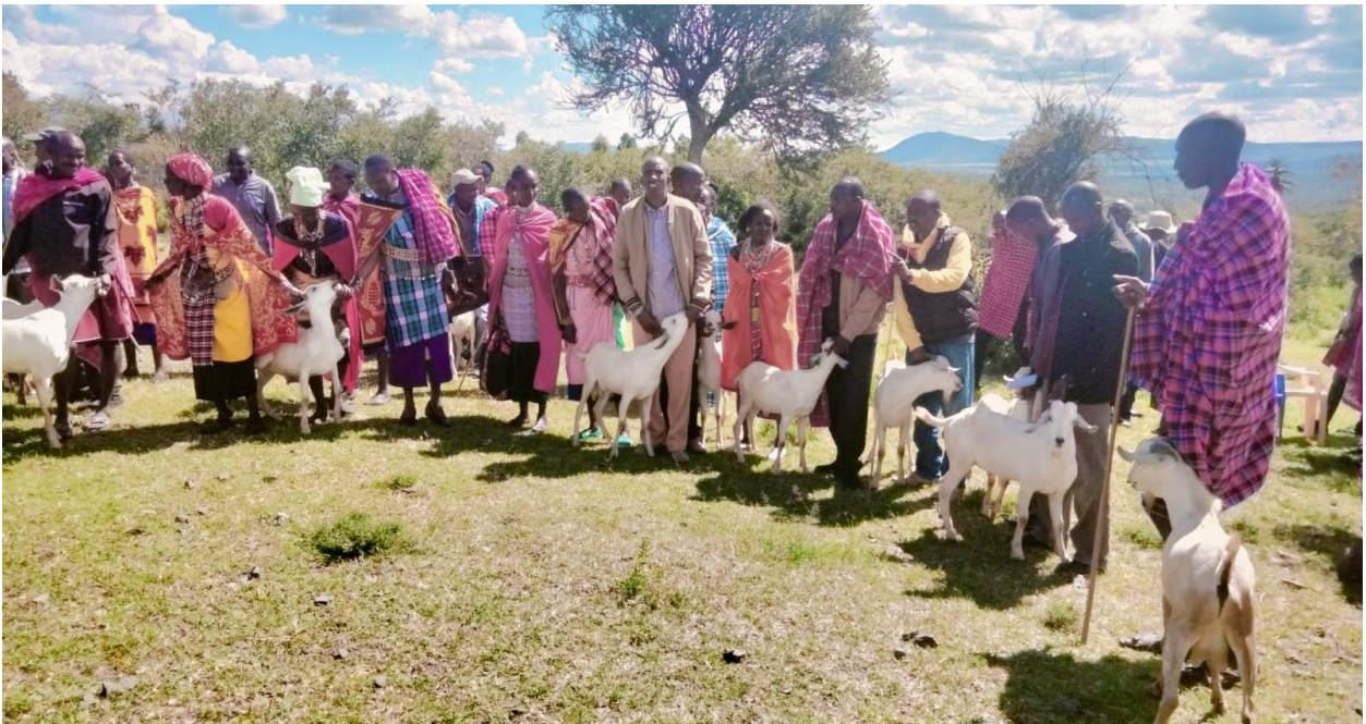
Galla bucks distribution