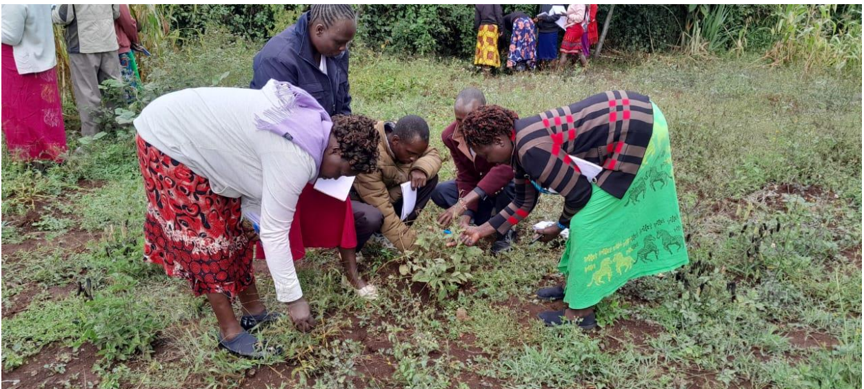
Farmers' Field School Training