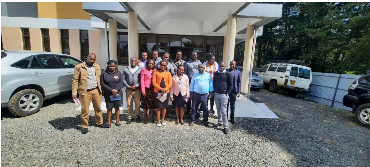
ADSS Staff team